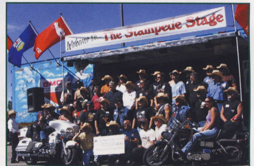
All Harley riders pose prior to heading off to the Alberta Children's Hospital with the donated money and toys galore!