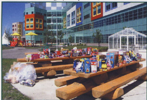
Tables full of toys for all the girls and boys at the Alberta Children's Hospitals also donated by ECL and friends.